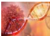
DNA & RNA Extraction