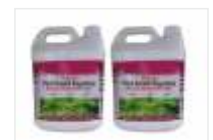
Plant Growth Regulators