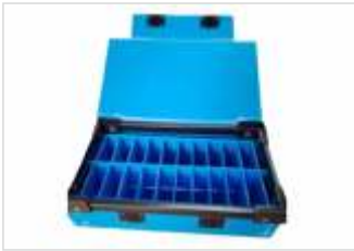
Food & Beverages Container