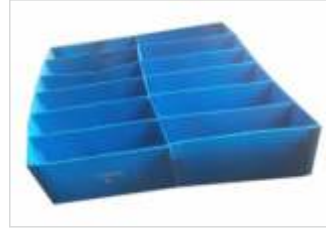
Coroplast Corrugated Box