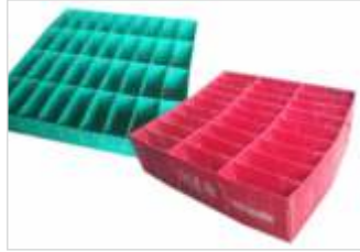
Automotive Sector PP Box