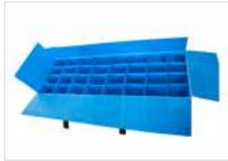
Industrial Storage Container