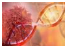
DNA & RNA Extraction