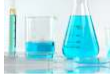
Pharmaceutical Liquid filling