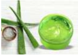
Aloe vera Gel