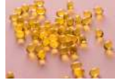
Vitamin D 3