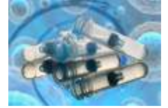
Sample Homogenisation For Plasmid