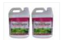
Plant Growth Regulators